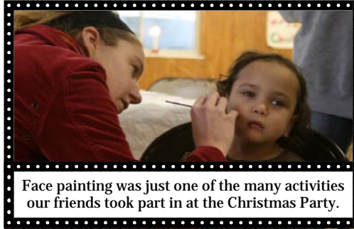
Face painting was just one of the many activities our friends took part in at the Christmas Party.

And come they sure did from all over the county. Of smiles and hugs there was oh, such a bounty.